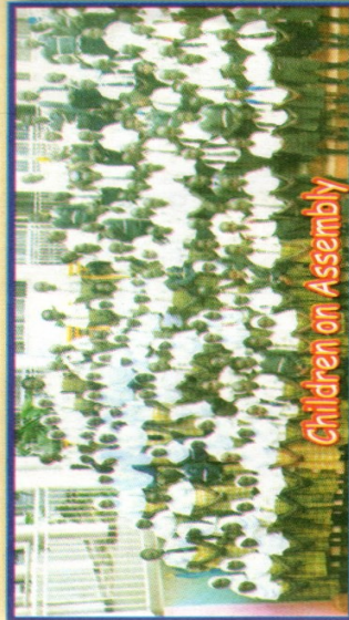
Children on Assembly

To be a leading primary institution in providing high quality inclusive education in Uganda and across